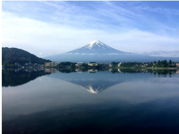
Stay: Lake Kawaguchi

One of the five Fuji lakes, it is the best place to see Mount Fuji. There are nostalgic buses for tourists by the lake, built art galleries and recuperation places, or the starting point of Mount Fuji, so tourists come in an endless stream. The lake has the only island in the five lakes, so you can enjoy the magnificent scenery from Lake Kawaguchi Bridge. From the north of the mouth of the river, the "reverse Fuji" (the reflection of Mount Fuji by the Lake Kawaguchi) is a symbol of the beauty of Japan.